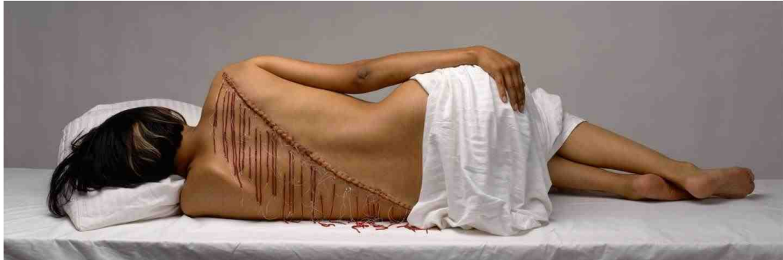
Figure 15. Fringe , 2008.