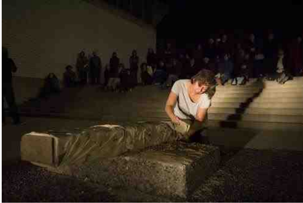
Figure 11. Making Always War , 2008. Courtesy of the artist and Vancouver Art Gallery.