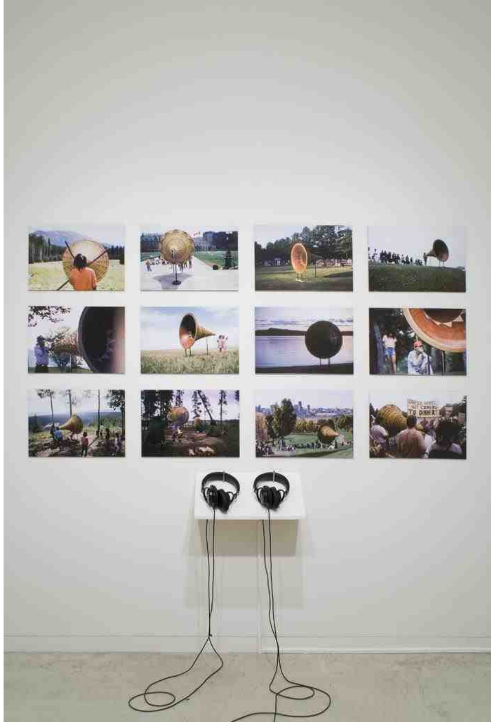
Figure 9. Ayum-ee-aawach Oomama-mowan: Speaking to Their Mother, 1991-1996.