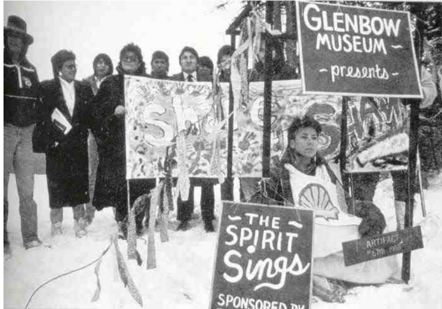
Figure 6. Artifact 671B , 1988.