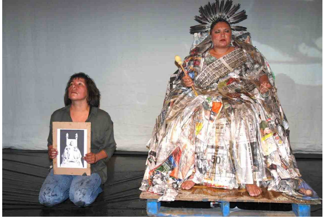
Figure 12. Victorious , 2008. Performance assistant: Daina Warren.