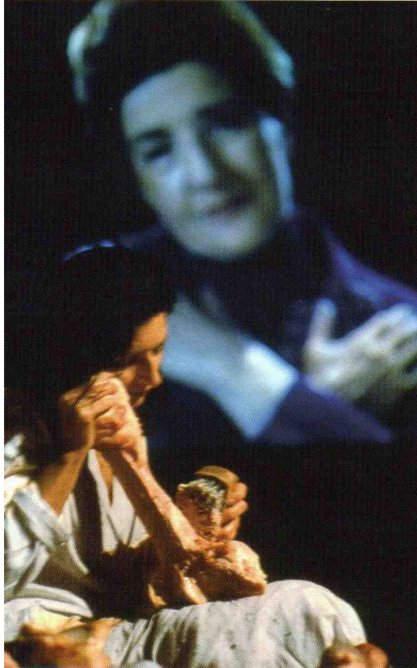
Figure 5. Balkan Baroque , Video installation and performance XLVII Biennale, Venice, 1997. © 2010 Marina Abramović. Courtesy of Sean Kelly Gallery/ (ARS), New York. Photo: Elio Montanari.