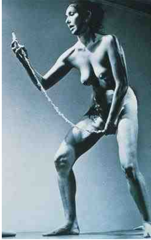
Figure 2. Interior Scroll , 1975. © 2010 Carolee Schneeman/Artists Rights Society (ARS), New York.