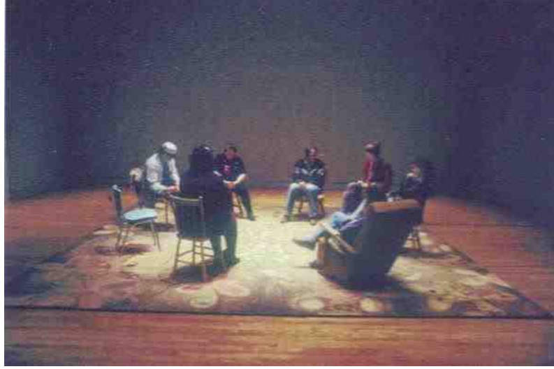
Figure 10. Belmore, Rebecca (Canadian, born 1960) Untitled (reconfiguration) / Mawu-che-hitoowin: A Gathering of People for any Purpose , 1992 (original), 2003 plywood, paint, vinyl, audio cassette 490 x 490 cm (installed) Collection of the MacKenzie Art Gallery purchased with funds raised by the MacKenzie Gallery Volunteers in celebration of their 40th Anniversary and with the financial support of the Canada Council for the Arts Acquisition Assistance Program.