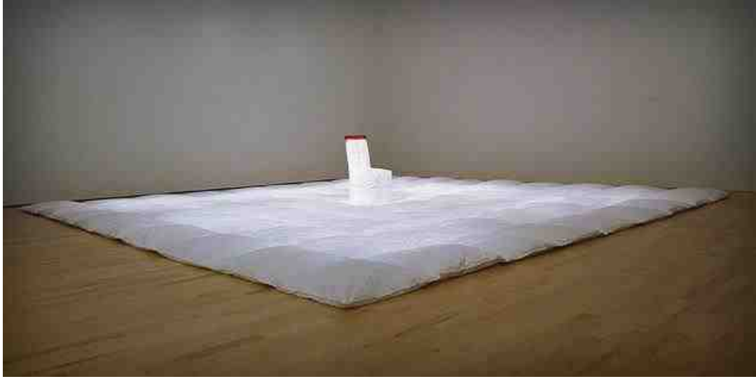
Figure 14. Blood on the Snow , 2002.