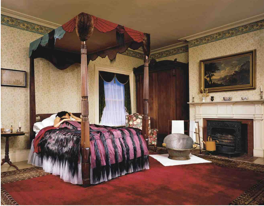
Figure 8. Wild , 2001.