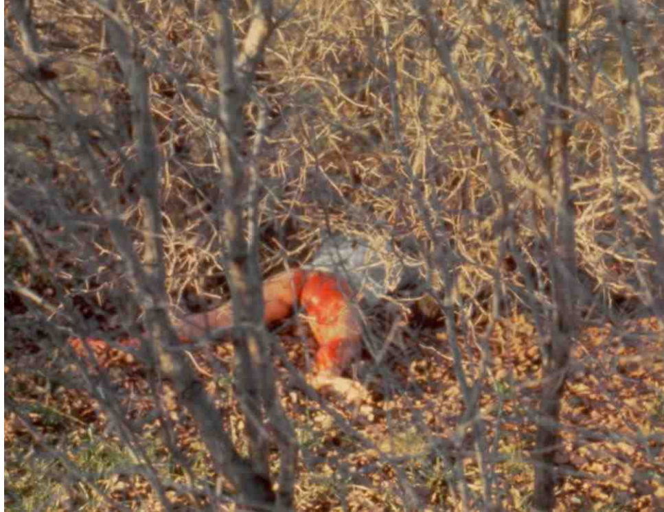
Figure 4. Ana Mendieta, Untitled (Rape Performance) 1973, Lifetime color photograph 8 x 10 inches (20.4 x 25.4 cm).