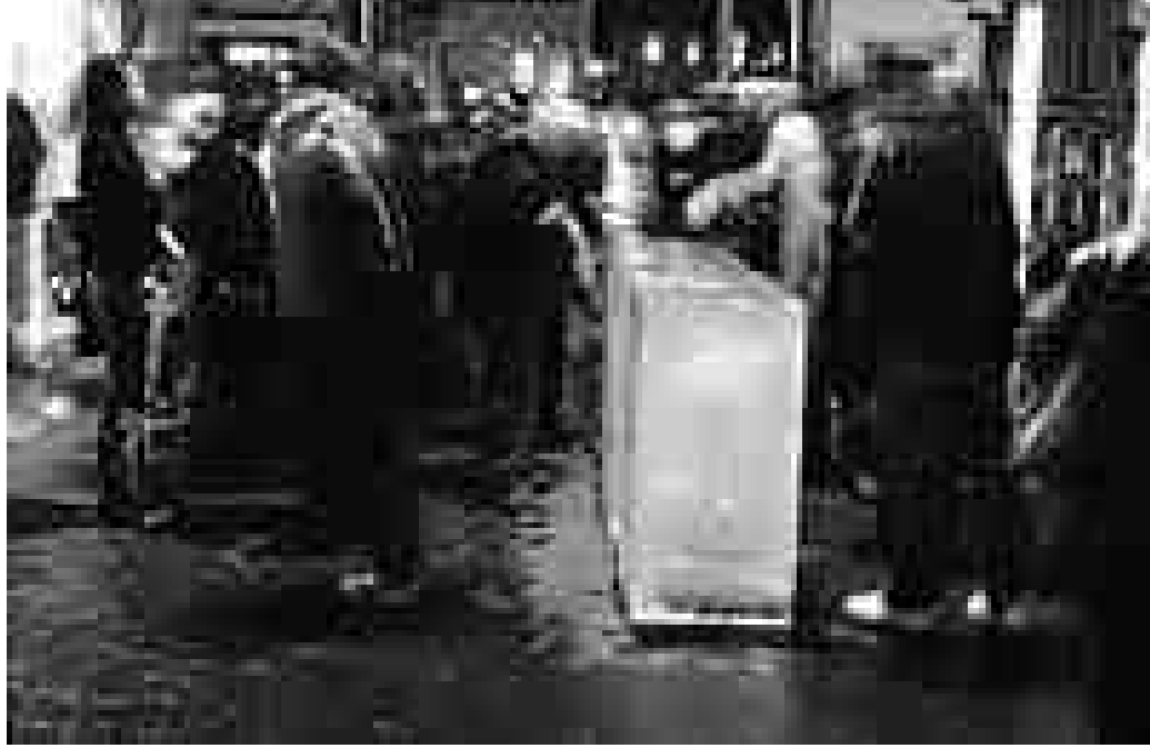
Figure 16. Freeze , 2006.