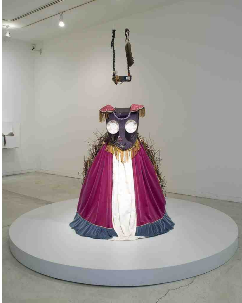
Figure 1. Rebecca Belmore. Rising to the Occasion , 1987-1991. Mixed Media, 2.0x1.2x1.2m. Gift from the Junior Volunteer Committee, 1995. Art Gallery of Ontario, 95/173.